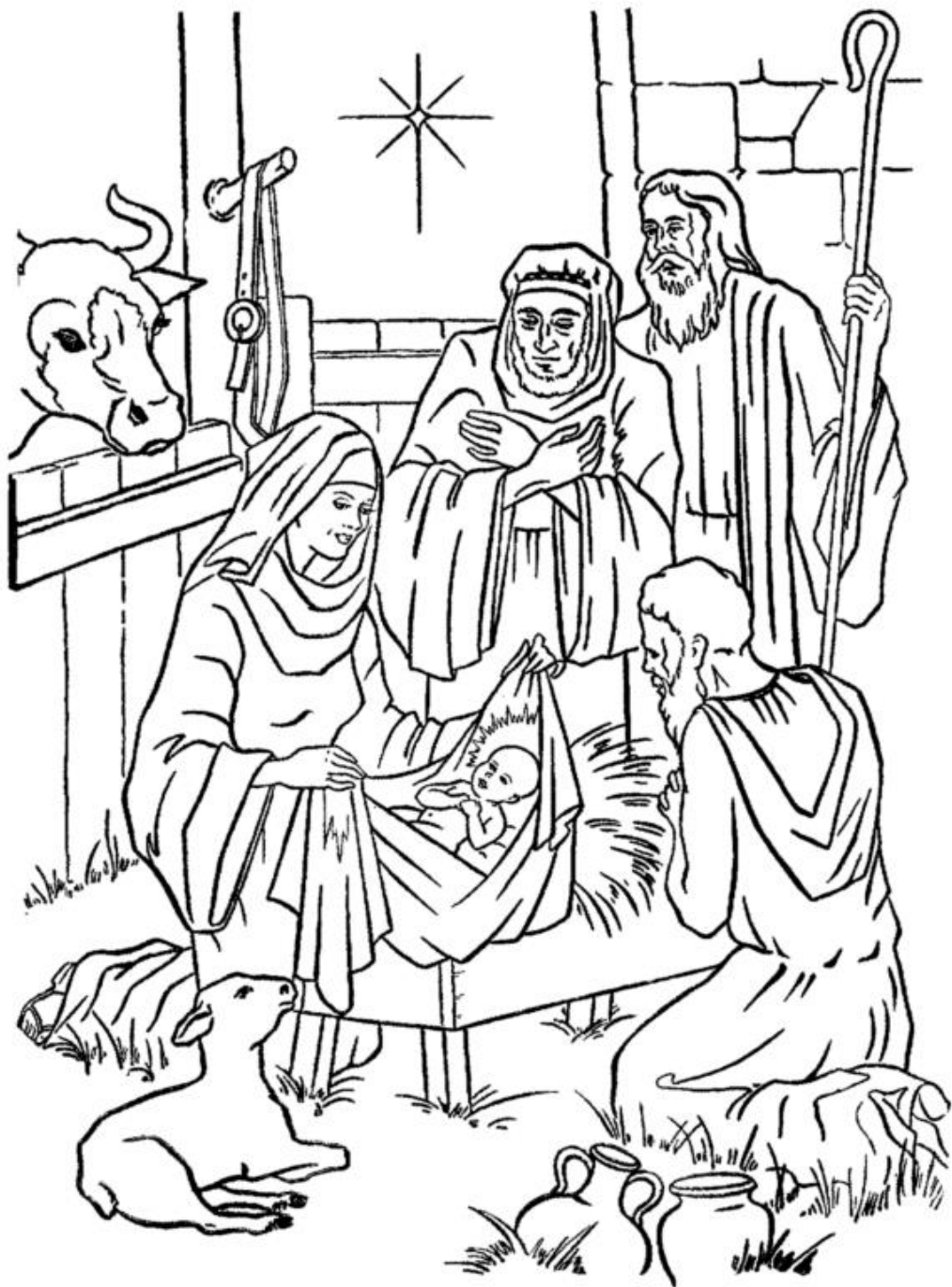
Another picture to colour in.