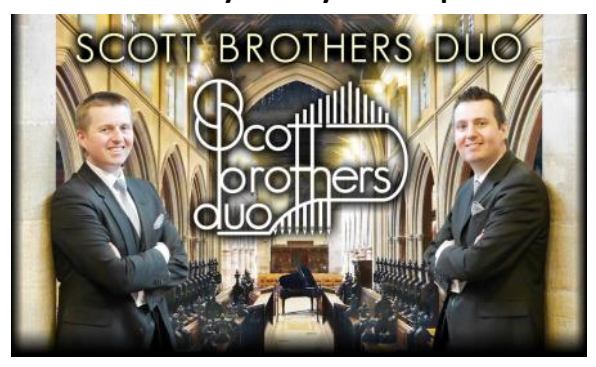
Tickets £10 - pay on the door (includes light refreshments)