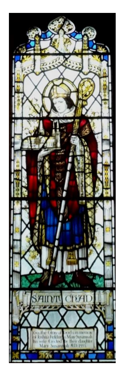
St Chad born 634, died 2 March 672