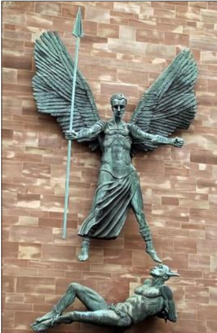
Coventry Cathedral's "St Michael's Victory over the Devil" by Epstein

Michaelmas is celebrated on 29 September, traditionally the last day of the year's harvest season, and in medieval times the day used by farmers to mark the changing of the seasons.